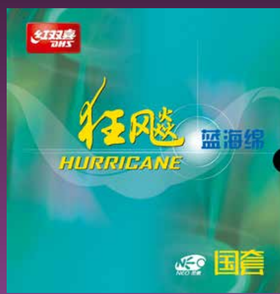
NEO 狂飚3 NEO HURRICANE 3