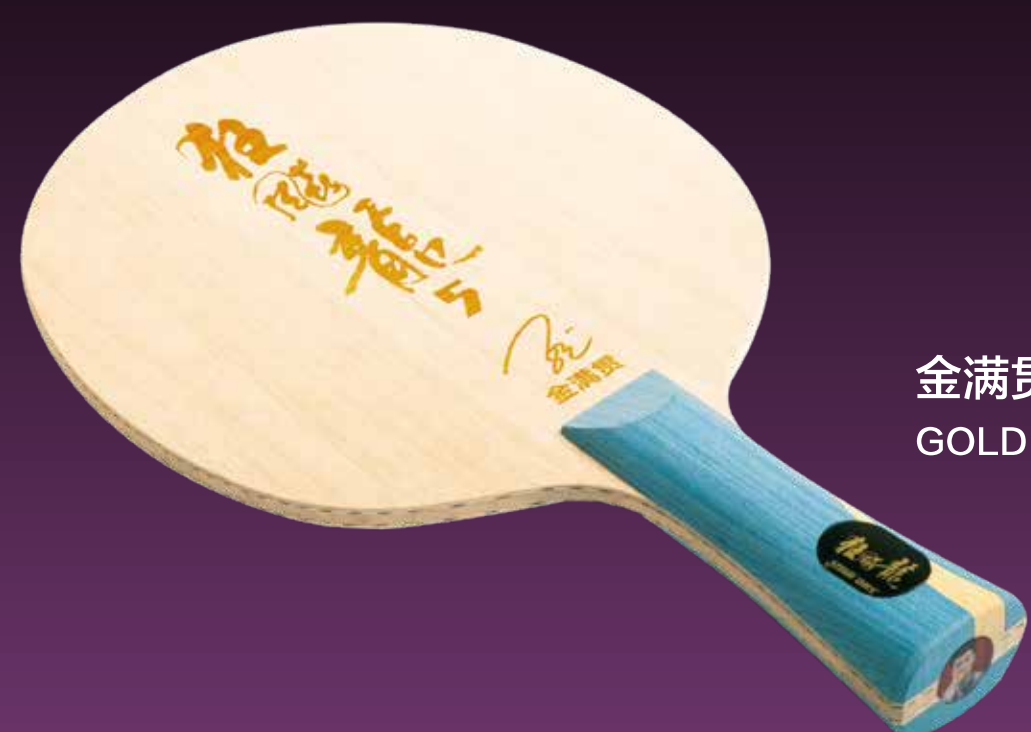
金满贯-狂飚龙5 GOLD SLAM HURRICANE Long 5