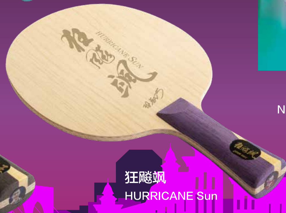
狂飚飒 HURRICANE Sun