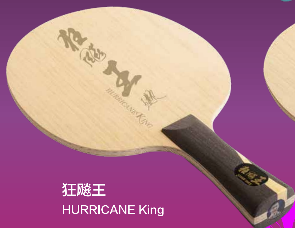
狂飚王 HURRICANE King