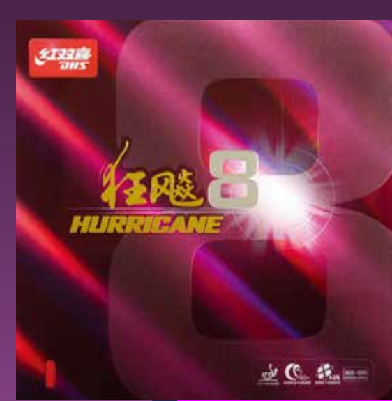
狂飚8 HURRICANE 8