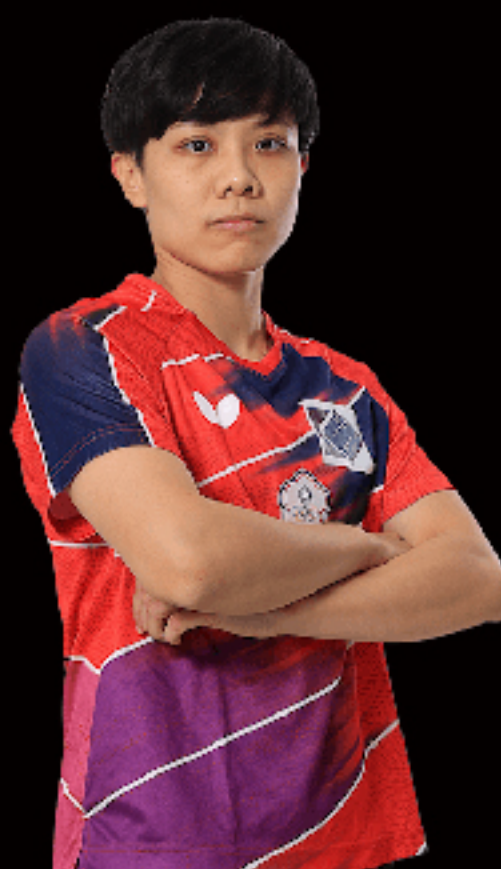
鄭怡靜 CHENG I-Ching