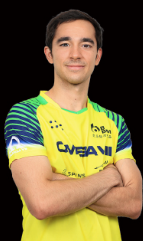
卡爾德拉諾 Hugo CALDERANO