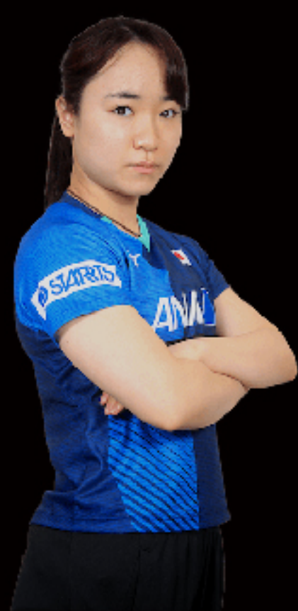
伊藤美誠 Mima ITO