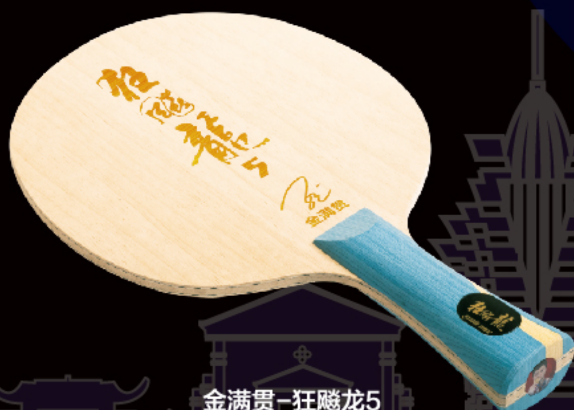
金满贯-狂飚龙5 Gold Slam Hurricane Long 5