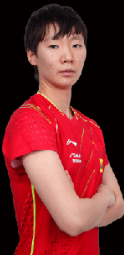
王曼昱 WANG Manyu