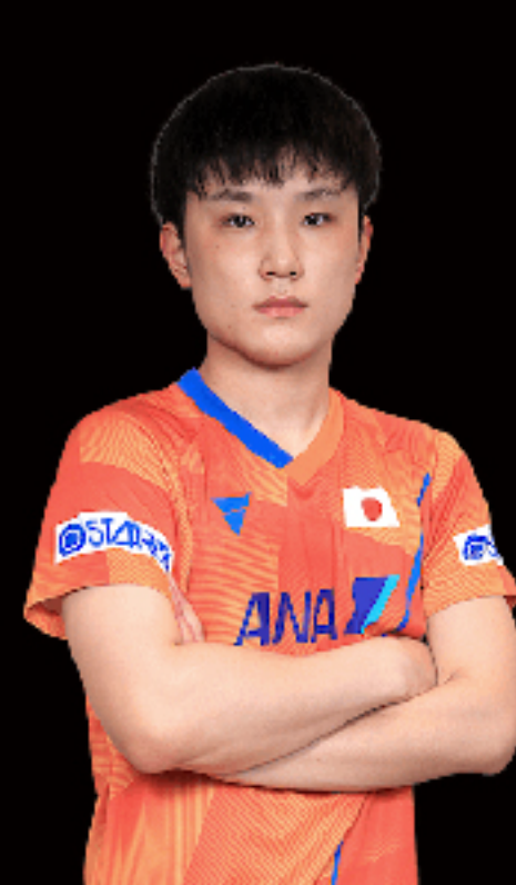
張本智和 Tomokazu HARIMOTO