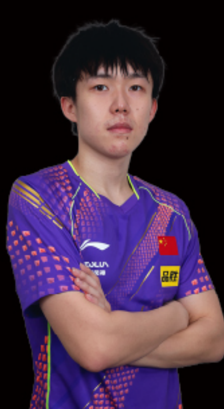
王楚欽 WANG Chuqin