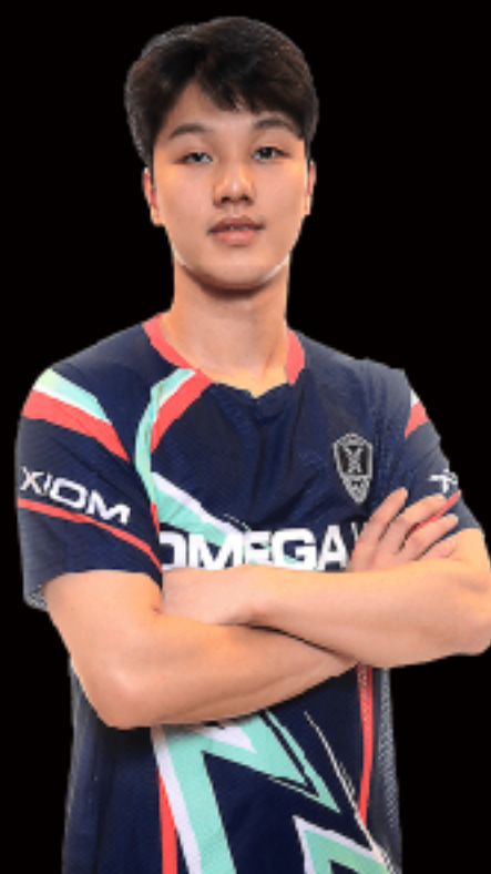
安宰賢 AN Jaehyun