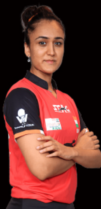
巴特拉 Manika BATRA