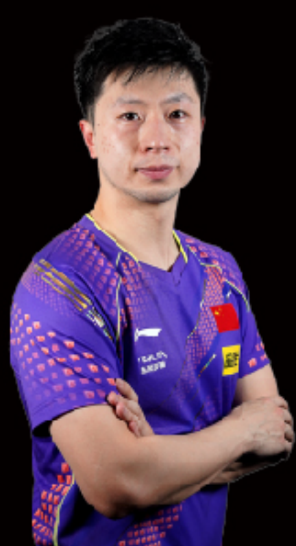
馬龍 MA Long