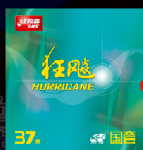
NEO 狂飚3-37柔 NEO HURRICANE 3-37