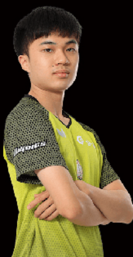
林昀儒 LIN Yun-Ju