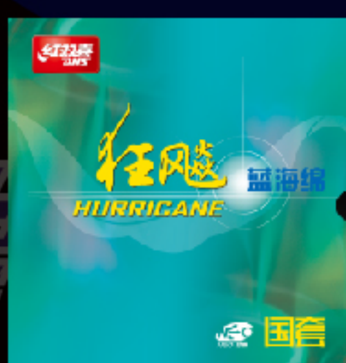
NEO 狂飚3 NEO HURRICANE 3