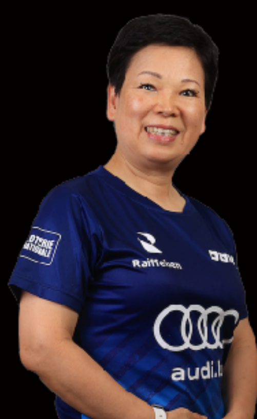
倪夏蓮 Xia Lian NI