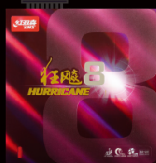
狂飚8 HURRICANE 8