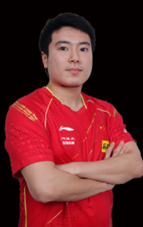
梁靖崑 LIANG Jingkun