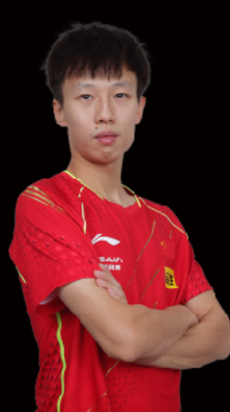
林高遠 LIN Gaoyuan