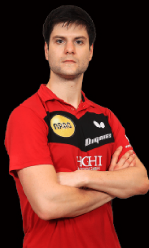
奧恰洛夫 Dimitrij OVTCHAROV