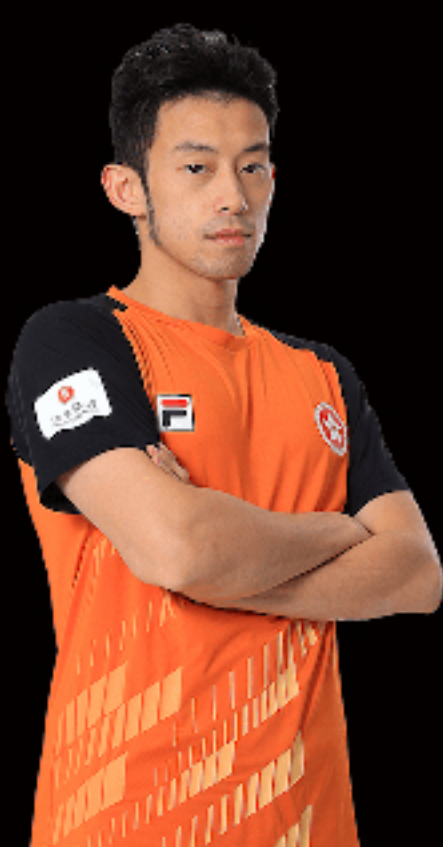
黃鎮廷 WONG Chun Ting