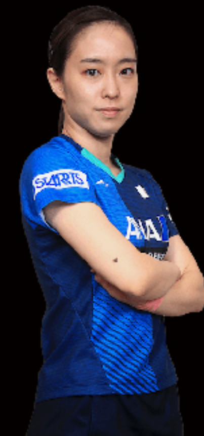
石川佳純 Kasumi ISHIKAWA