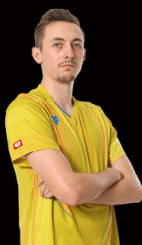
皮切福特 Liam PITCHFORD