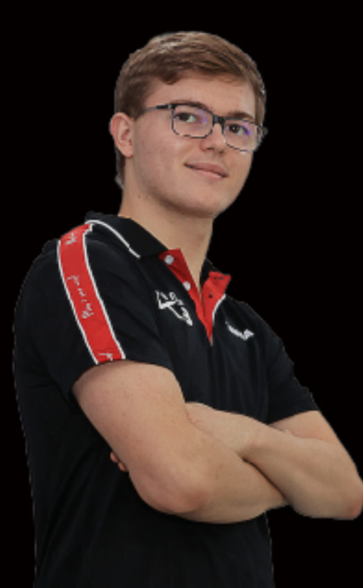
艾利克斯·勒布倫 Alexis LEBRUN