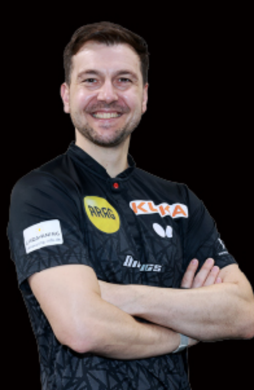
波爾 Timo BOLL