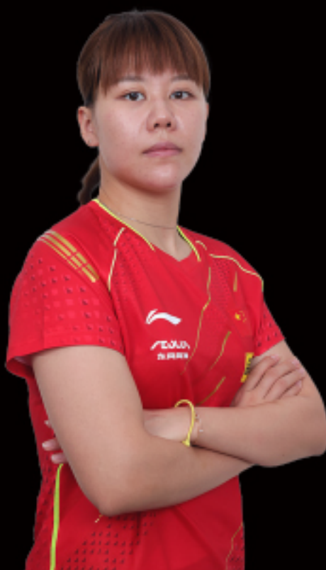
陳幸同 CHEN Xingtong