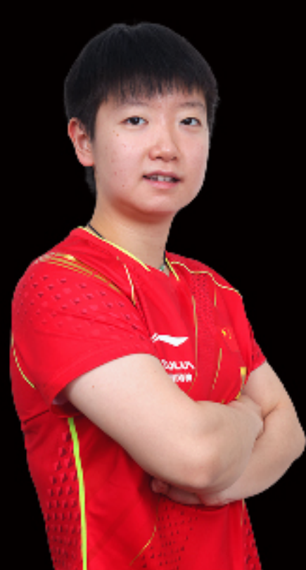
孫穎莎 SUN Yingsha