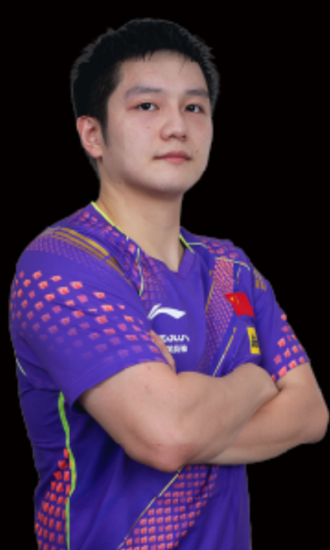
樊振東 FAN Zhendong