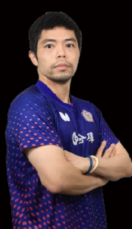
莊智淵 CHUANG Chih-Yuan